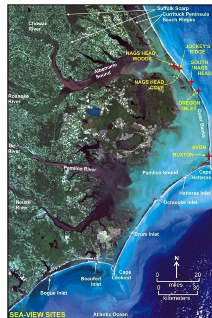
Figure 1-2. This satellite image shows the Sea-View site locations. The image is a joint product of the NASA Landsat Project Occupancy Office, Goddard Space Flight Center, and the U.S. Geological Survey EROS Data Center. Figure is modified from Figure 2-1-3, p. 19 in Riggs and Ames (2003).

The interplay between the regularity of astronomical tides, irregularity of wind tides, and vast array of brackish waters characterizing the estuarine system largely determines what coastal plant and animal communities occur within the estuarine systems and where they thrive.